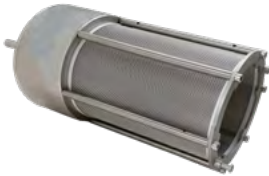
Washing Drum 2.5 kg