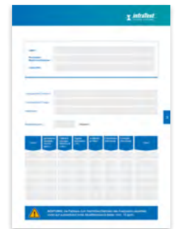
Solvent Log Book