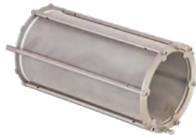
Washing Drum 3.5 kg