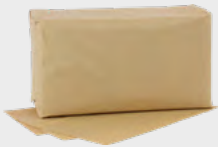
Insert Paper for Centrifuge Cup