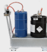
Supply and Dispo- sal carriage