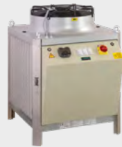
Water Cooling Unit